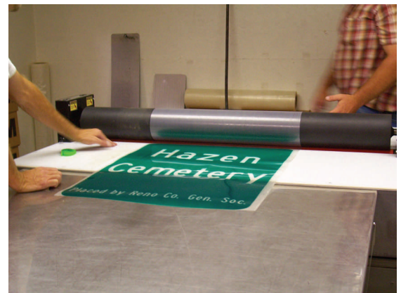
Right: Hazen Cemetery sign lettering preparation.

Each 25 x 30 sign will cost $65. This cost includes the u-channel post and hardware. Installation arrangements will be made with each location. Below is a list of cemeteries without a sign. Contact will be made with responsible parties to obtain permission for sign placement, as funds become available for this project. If you would like to sponsor a sign or contribute toward this project please mail your tax deductible contributions to our post office box. The Antioch and Hazen signs will be installed very soon.